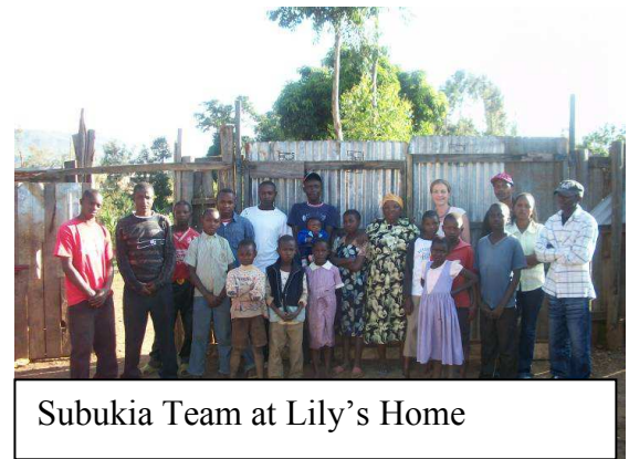
Subukia Team at Lily's Home