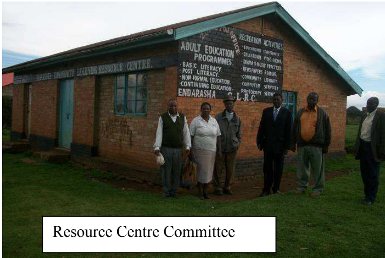
Resource Centre Committee

This centre started as an adult education class. Then it gives birth to a polytechnic. And now it aims to reach the whole community by equipping it with a library.