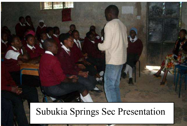
Subukia Springs Sec Presentation