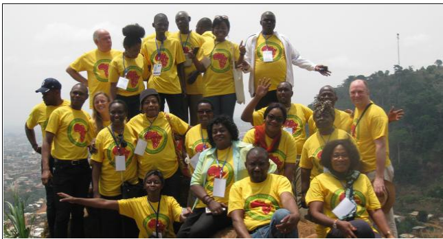
Participants in the IofC training

“In March, the CICM Centre in Mvolye, Yaoundé was a hive of activity, hosting participants who had come to take part in the Creators of Peace Circles and the Francophone Initiatives of Change training, as well as the Africa Coordination Group (ACG) consultation. Seventeen participants from sixteen different African countries took part in the consultation.